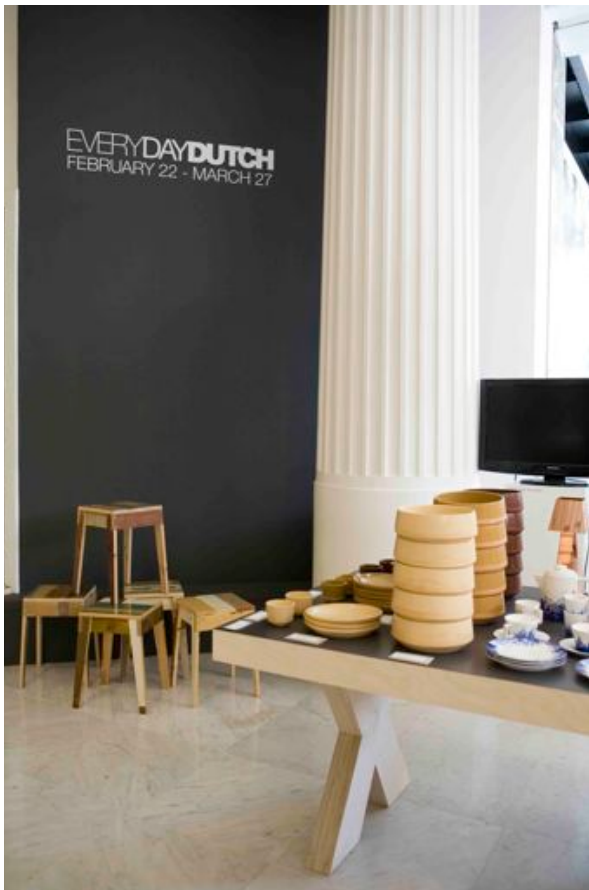
Scrapwood stools by Piet Hein Ekk and ceramics by Atelier NL for Royal Tichelaar Makkum.