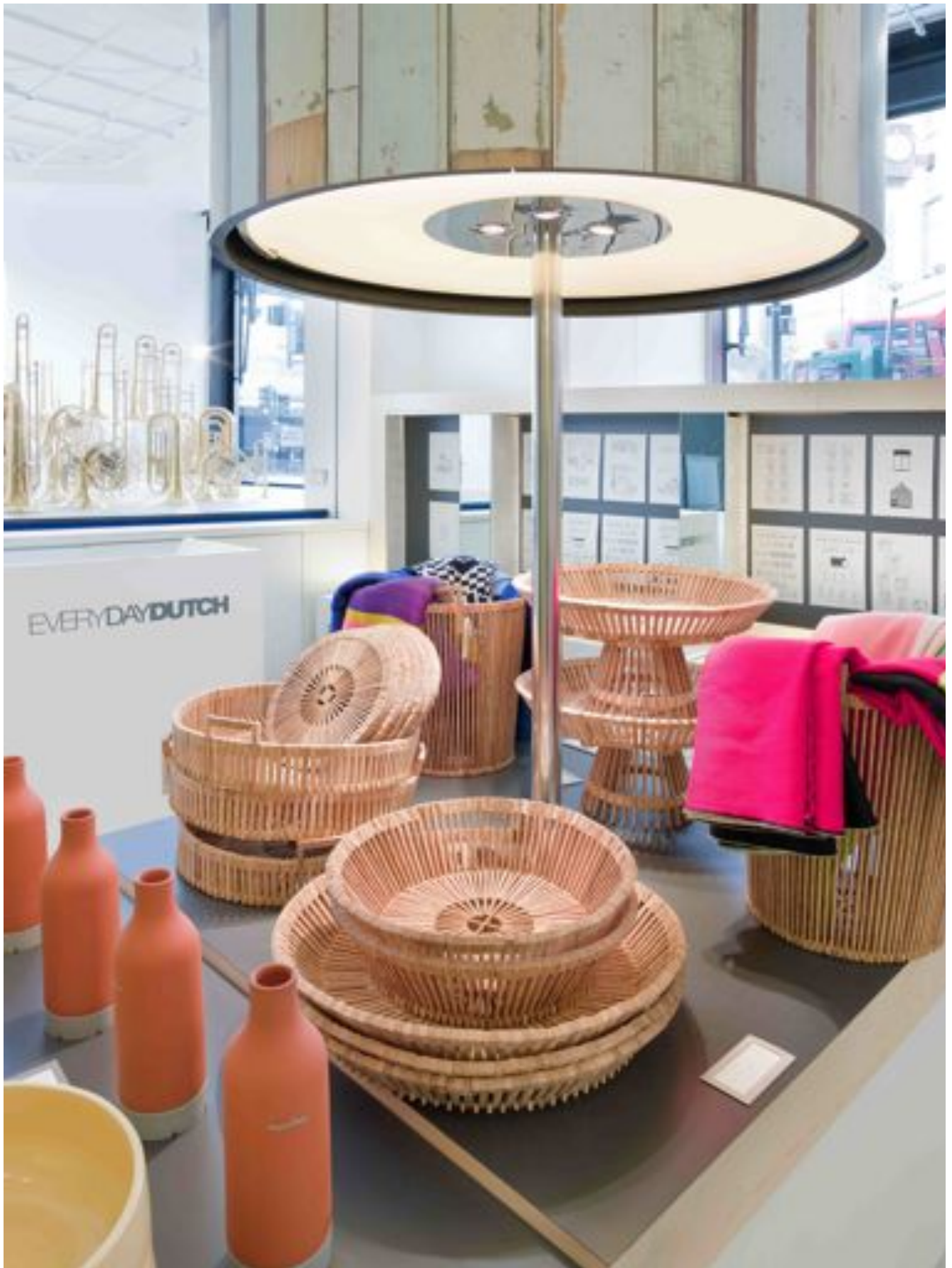
Terracotta water carafes by Arian Brekveld for Royal VKB, Fair Trade Original baskets and Scrapwood Wallpaper (on lamp) by Piet Hein Eek, wool throws by Scholten & Baijings, shawl by Zelda Beauchampet.