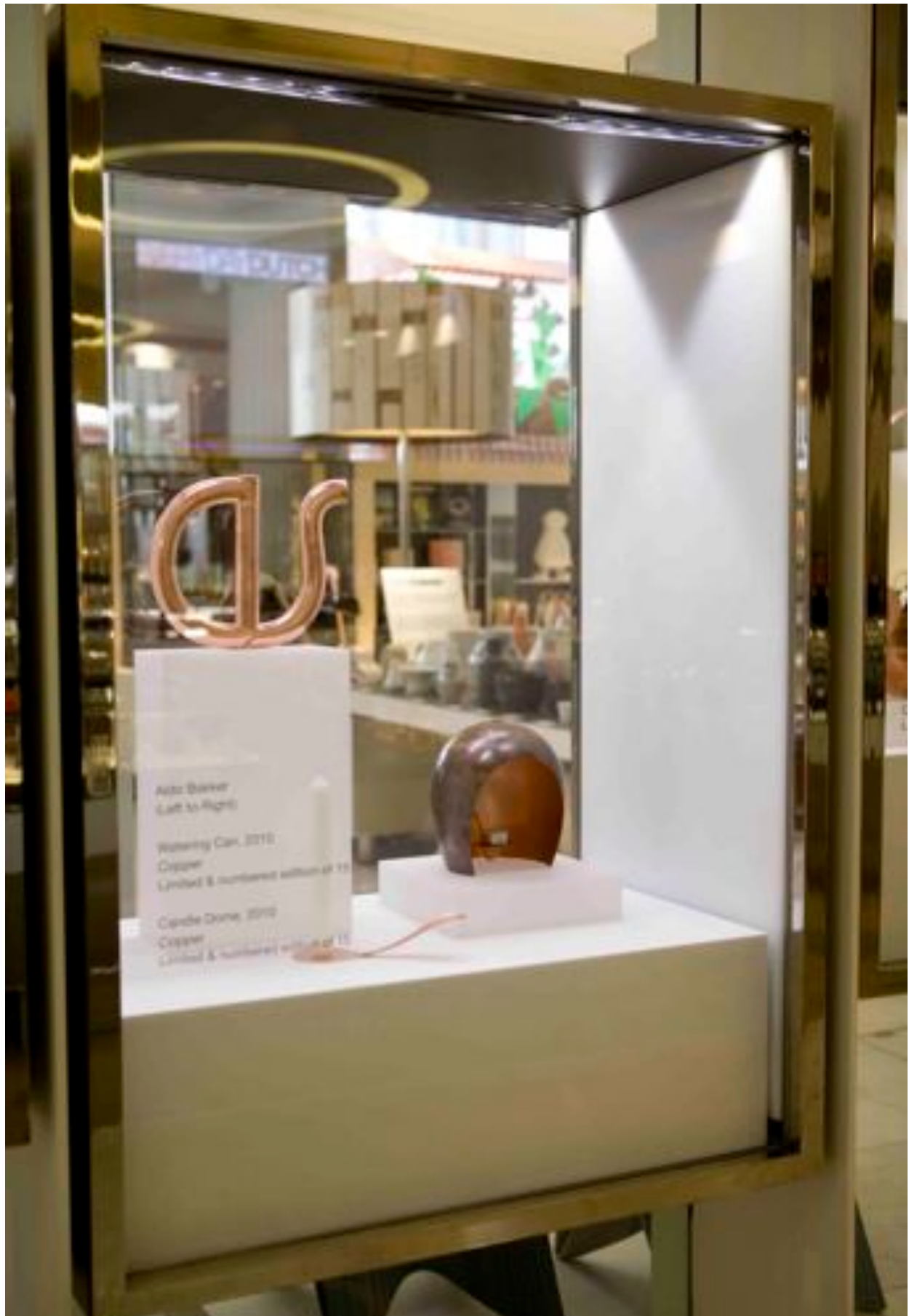
Watering Can, Candle Holder and Candle Dome from Aldo Bakker's Copper Collection for Thomas Eyck Aldo Bakker's designs are based on a radical rethinking of how we perform daily tasks.