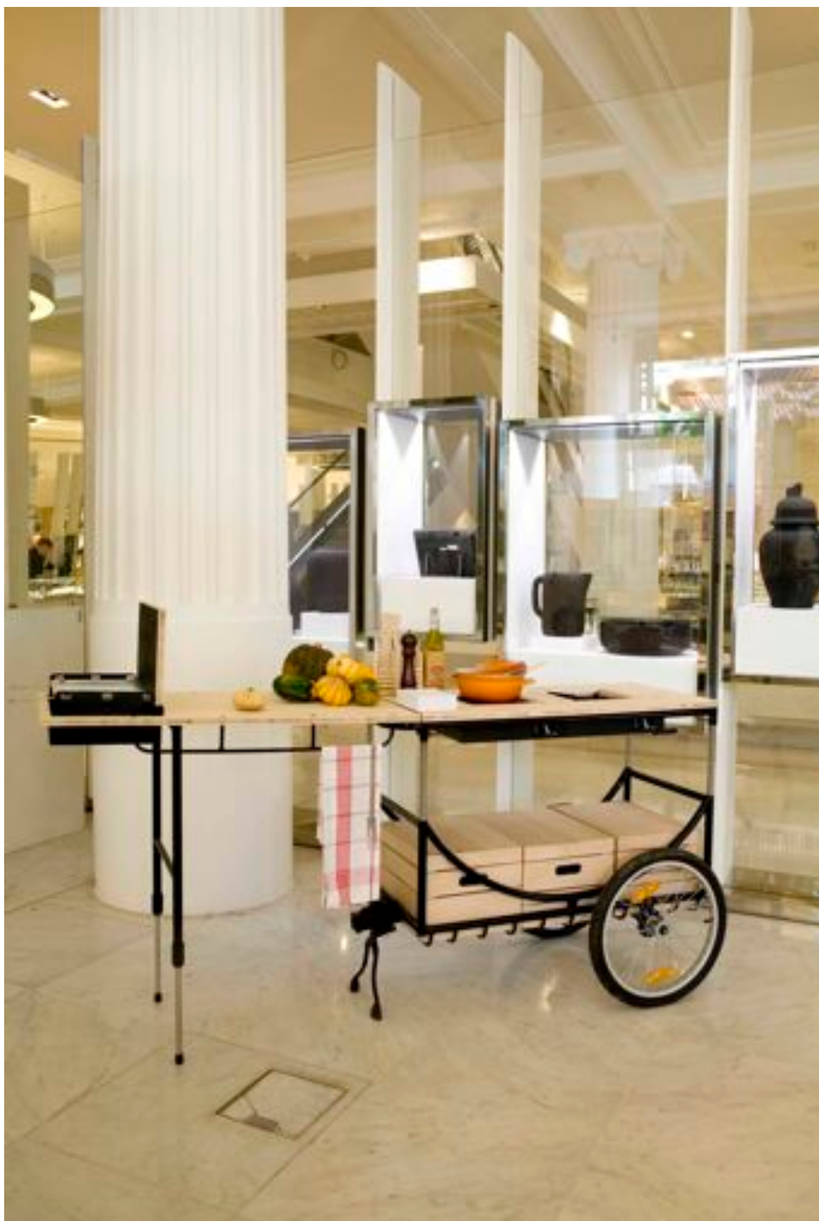
Bike Stove by Design Academy Eindhoven 2010 graduate Florike Martens

Designed to attach to a bicycle, the compact trailer folds out to make a serviceable cooking unit including a barbeque and burners, insulated cooler, water tap and pots, pans and tableware for eight.