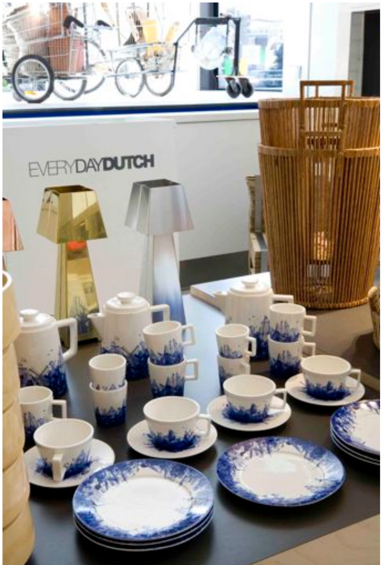
Products by Piet Hein Eek include Table Lamps, Delft Blue Ceramics and Fair Trade Original baskets made from palmwood.