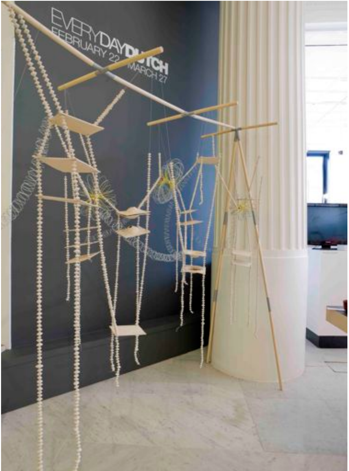
Mouse Mates by Design Academy Eindhoven 2010 graduate Roel de Boer

A whimsical home for mice that blurs the boundaries between pet and pest. The mice are drawn to the contraption – they are free to leave but choose to stay and play.