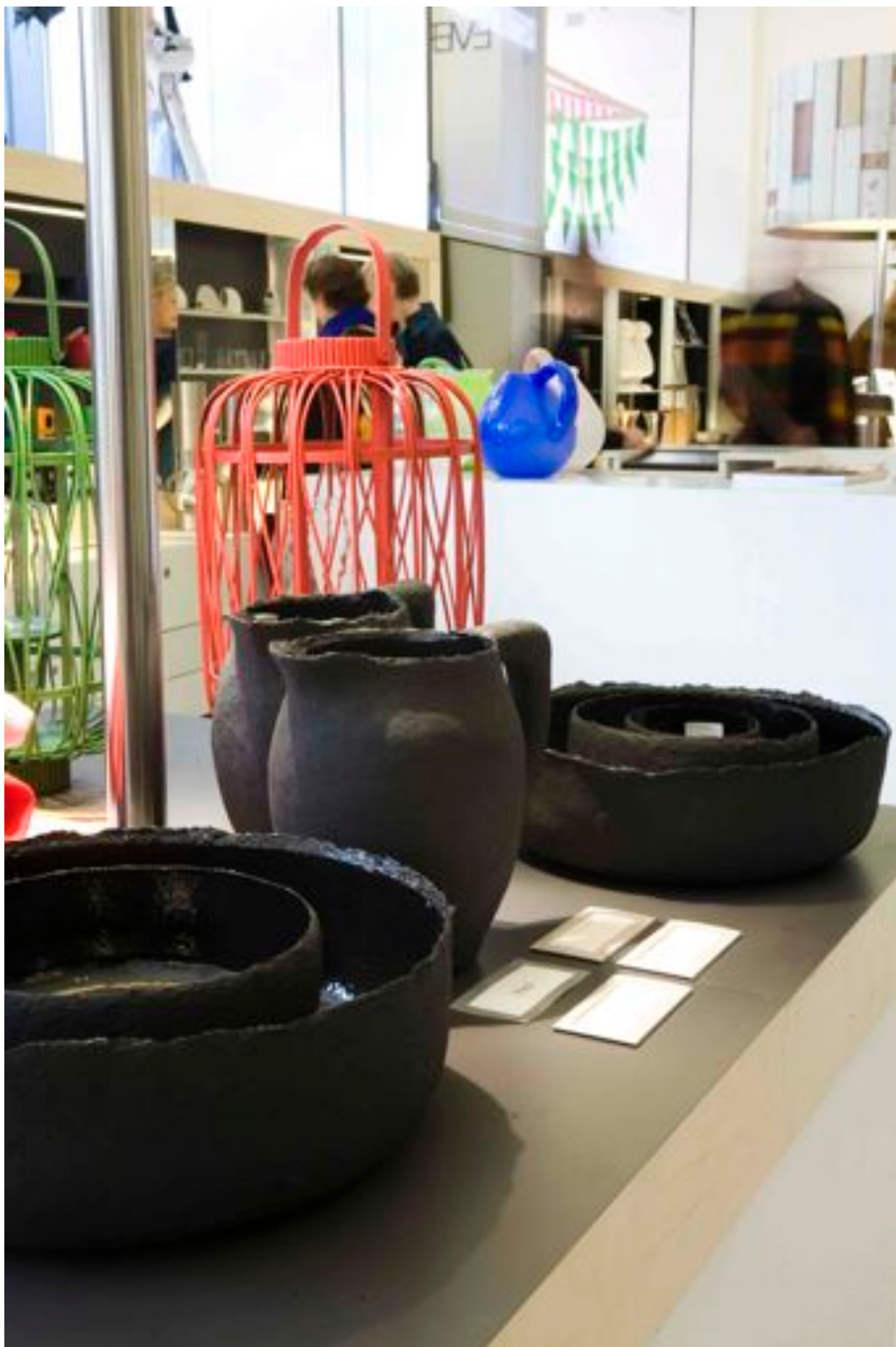
PULP 2.0 series by Jo Meesters and lanterns by Pols Potten.