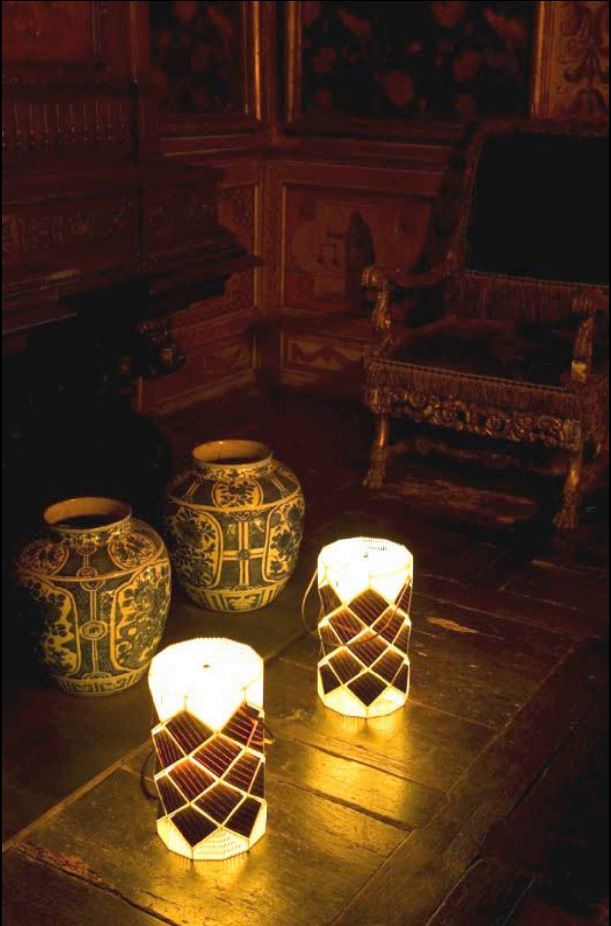
SOLAR LAMPION, 2004, DAMIAN O'SULLIVAN. Prototype

A concept for a modern take on a Chinese lantern powered by sunlight. While most solar lamps are left outdoors, Solar Lampion is designed to be brought indoors at night. The lighting fixture incorporates 30 miniature solar panels arranged in concentric circles and inclined at 30° to capture the maximum amount of sunlight to charge the lantern's battery. Each solar cell is connected to an LED.