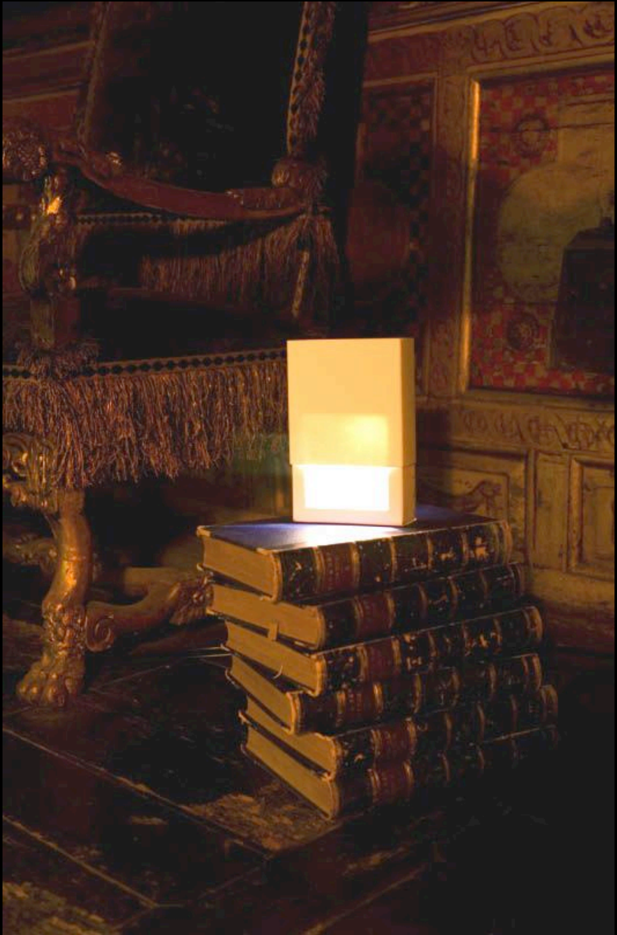
SCATOLA DELLA LUCE, 2009, MARIO NANNI, VIABIZZUNO. Prototype A portable reading lamp consisting of a sheath and inner drawer containing the LED. The drawer slides open and closed to vary the light intensity.