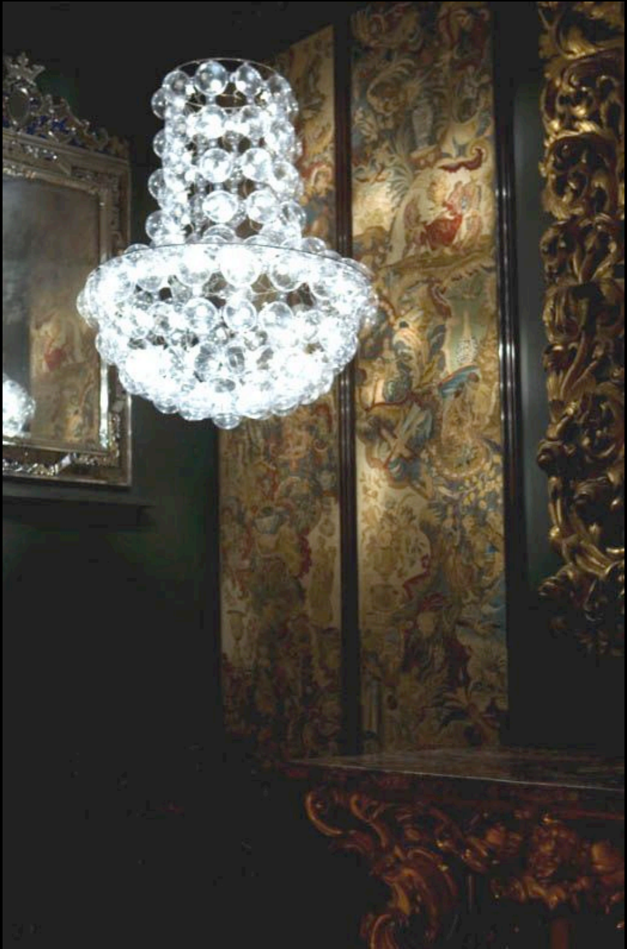
QUEEN'S CHANDELIER, 2008, PUFF-BUFF DESIGN A lightweight chandelier: each inflatable pocket contains an LED.