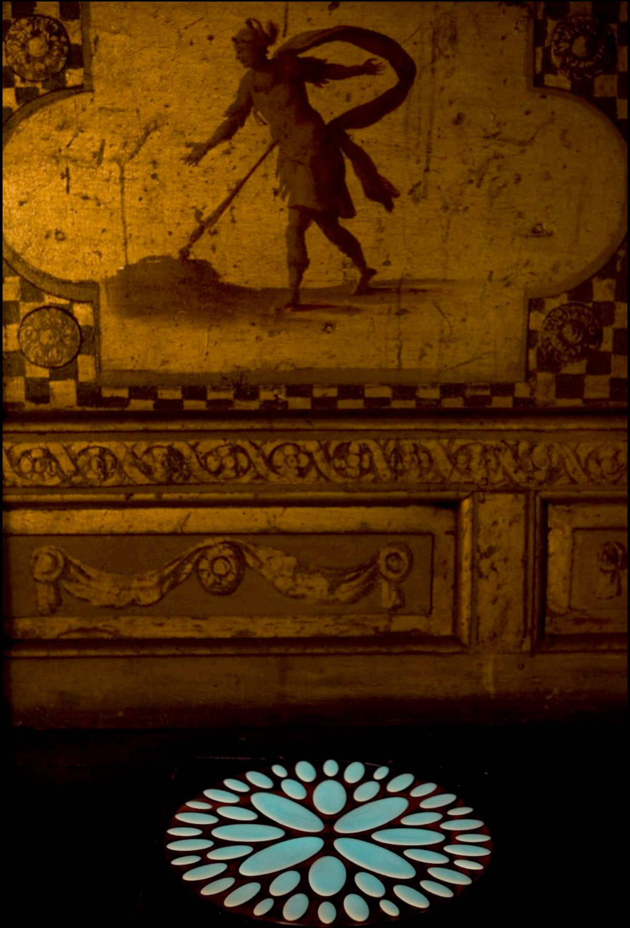
SHINE, 2009, VYTAUTAS PUZERAS

Inspired by electric sea creatures, Shine uses electroluminescent technology. The glowing elements on the pad can be charged from natural sunlight during the day and then gleam until dawn.