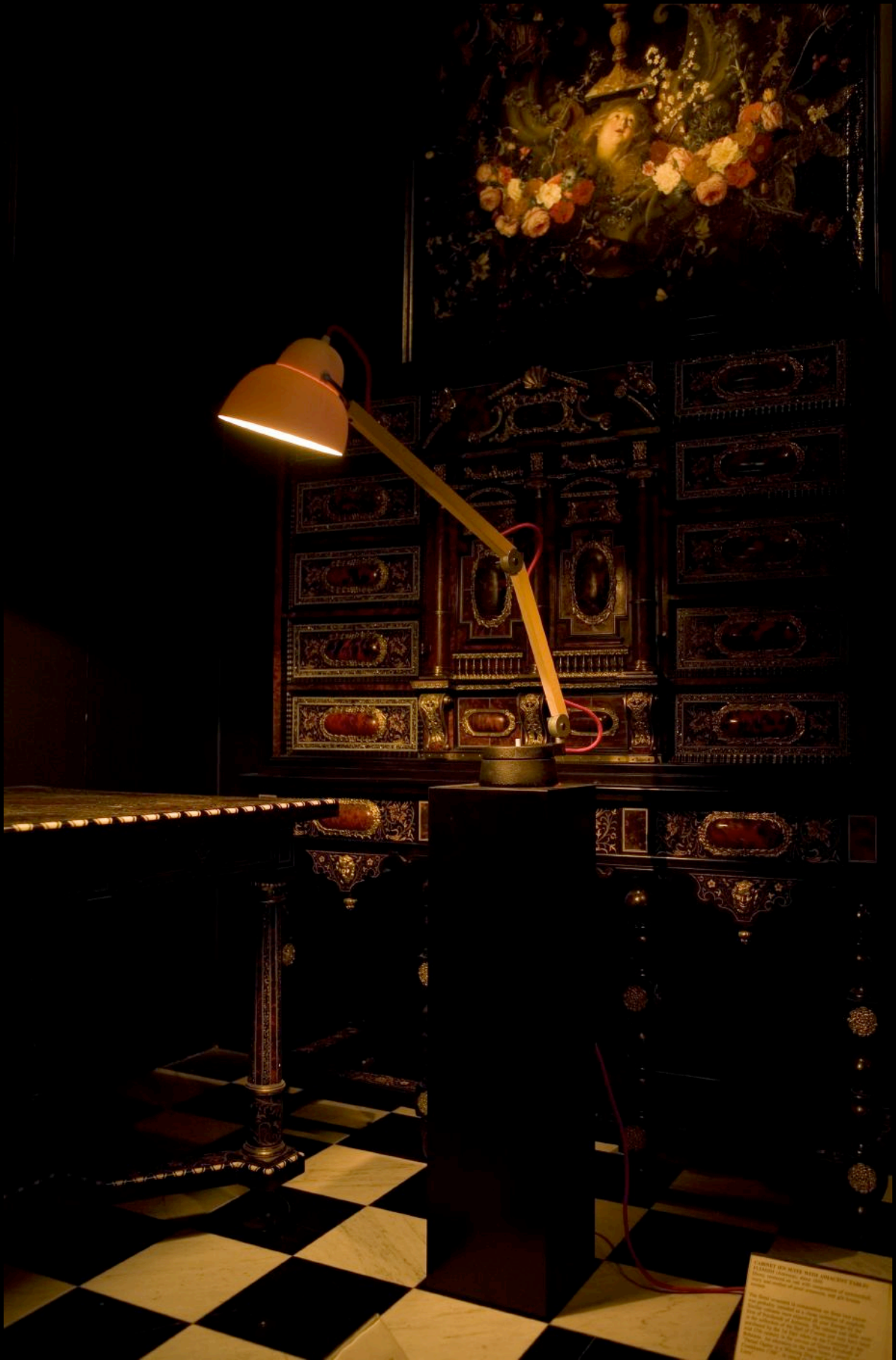
W08, 2008, STUDIOILSE

A modern take on the classic Anglepoise lamp, using what the designer describes as 'simple honest materials': 'Iron for its feelings of stability, reliability, trust; wood with its warmth and life'.