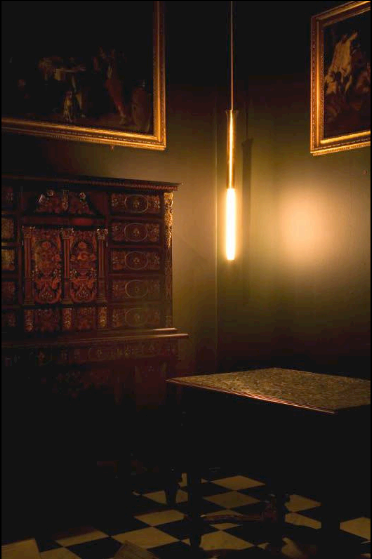
GOLD F LIGHT, 2009, MICHAEL ANASTASSIADES

A standard low-energy fluorescent lamp is transformed into an object of refinement and beauty.