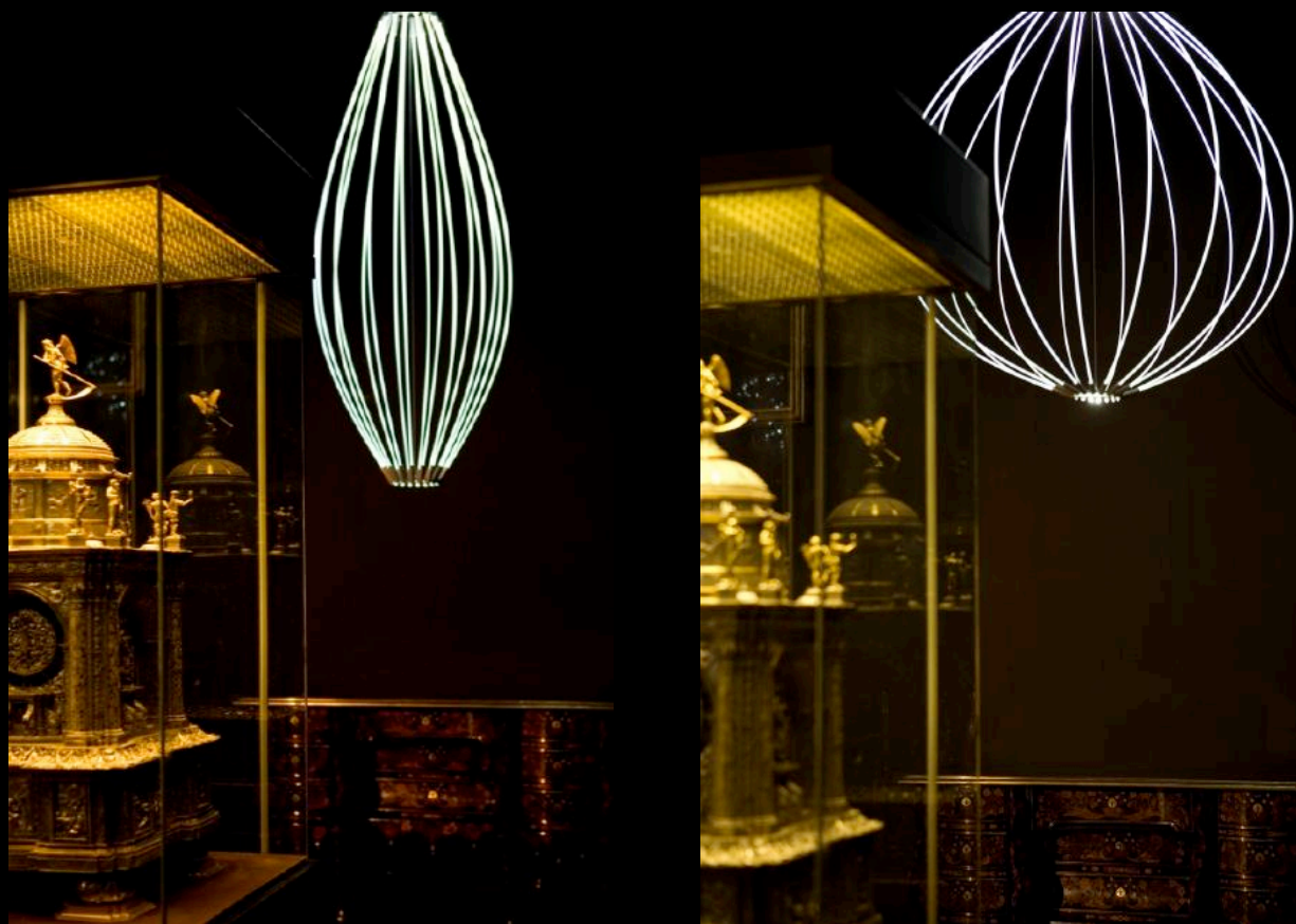
MEDUSA, 2008, MIKKO PAAKKANEN, SAAS INSTRUMENTS

Inspired by the movement of a jellyfish, Medusa is made of fibre optic rods lit by high-intensity LEDs. The rods expand and contract in a hypnotic motion. The movement can be stopped at any stage, so the light can be frozen in different shapes.