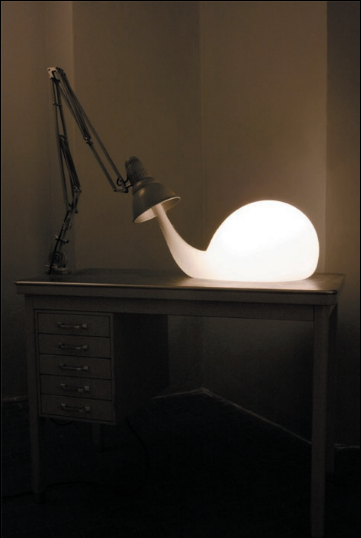
LIGHT BLUB, 2008, PIEKE BERGMANS

Light Blub is a giant light bulb that appears to be morphing into new forms, perhaps playfully symbolizing the end of the bulb as we know it.