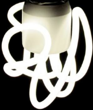
DOODLE, PLUMEN SERIES, 2009, HULGER. Prototype Designed as a reaction against the aesthetic of existing CFL products, Doodle is a proposal to give a more sculptural form to low-energy light bulbs.