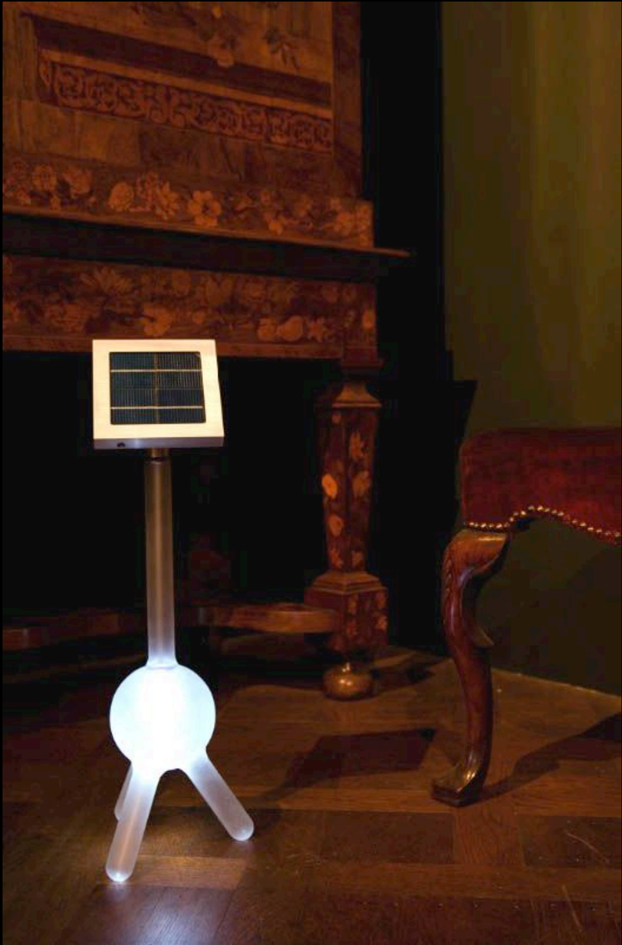
CEZ LIGHT, 2009, OLGOJ CHORCHOJ

A portable battery lamp charged by a photovoltaic panel. Exposing the panel for four hours to sunlight should generate enough energy to provide four hours of illumination.