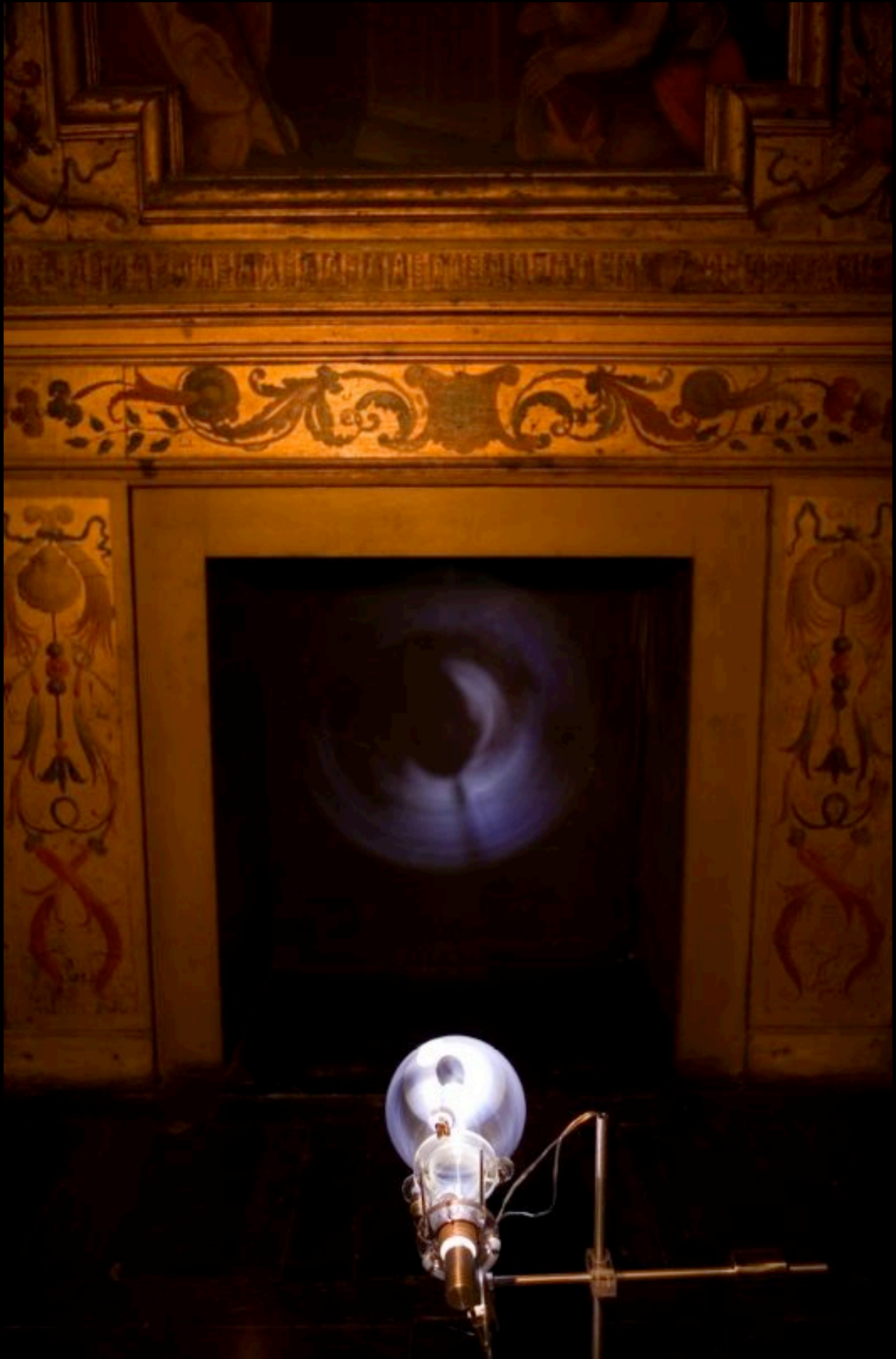
BULB, 2009, BÁLINT BOLYGÓ

The LED light passes through a large rotating incandescent bulb that has a photographic image of the world printed on its interior surface. The image is projected onto the surrounding space.