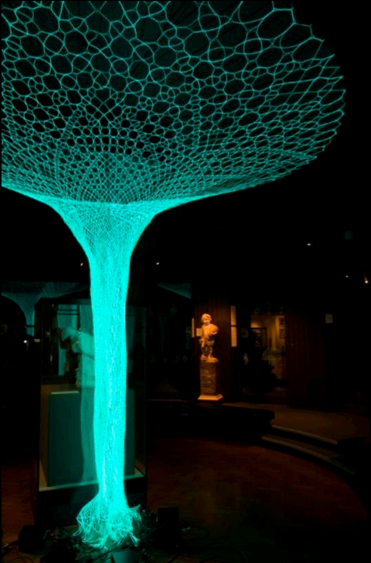
SONUMBRA, 2008, LOOP.PH (RACHEL WINGFIELD / MATHIAS GMACHL)

Developed as part of the World Bank project Lighting Africa, Sonumbra is a proposal for low-cost, low-maintenance lighting for regions without access to the electricity grid. An outside parasol, by day it provides shelter from the sun. By night it lights up, using the energy collected in solar cells embedded in its canopy.