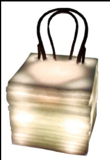
ICE AGE CHAIR, 2008, RADU COMSA Light diffuses through the fibre around the chair's shape and the chair itself disappears, reading as a negative image like a chair frozen in layers of old ice.