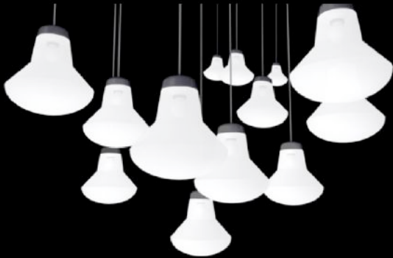
BLOW LIGHT, 2009, TOM DIXON Blow Light is specifically designed to accommodate a low-energy Compact Fluorescent Lamp, allowing the lamp to give a strong directional light through the clear base. Originally designed for the big Trafalgar Square Giveaway in 2007, Dixon gave away 1000 free lamps to raise awareness of CFLs and promote sustainable design.