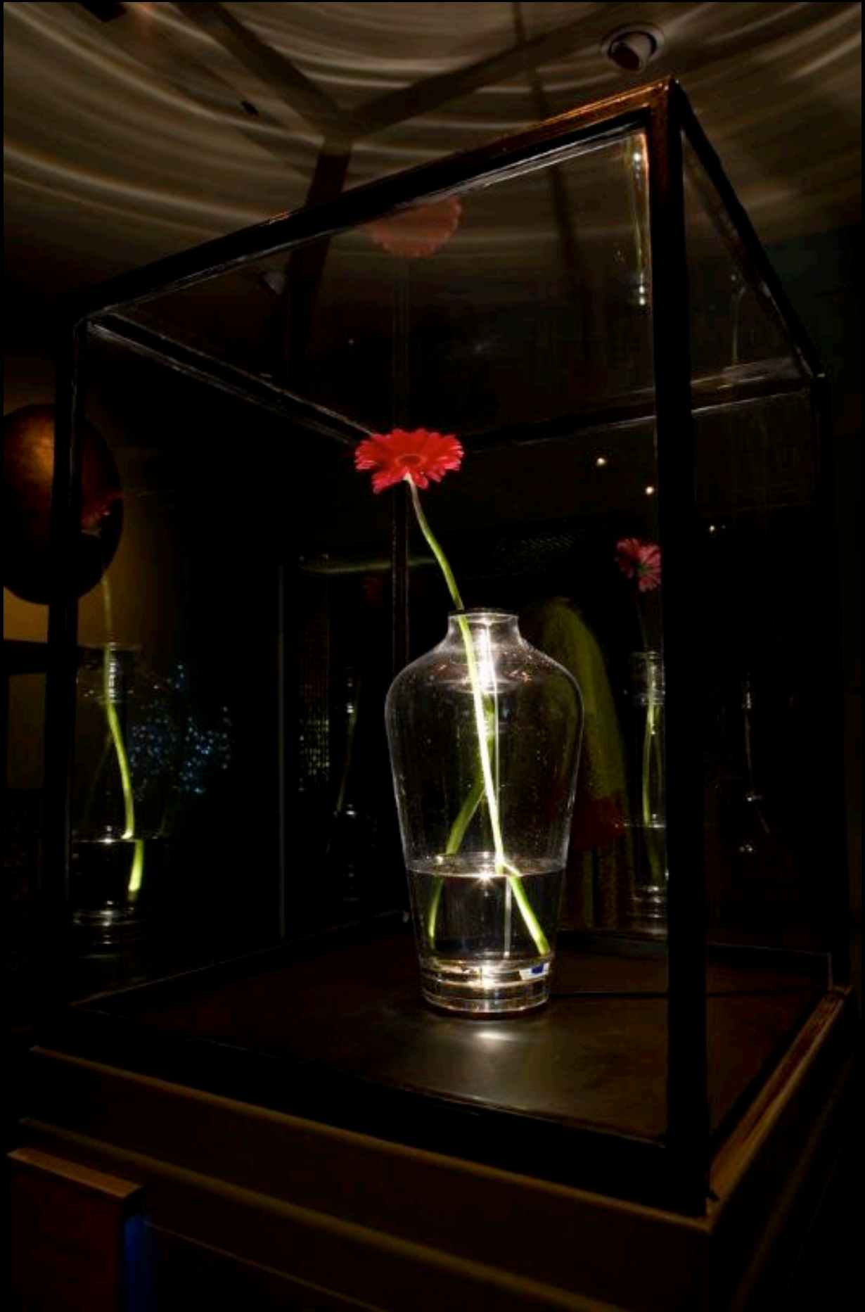
LIFE 01, 2009, PAUL COCKSEGE. Prototype

When a flower is placed in the water the vase lights up from within. The stem acts as a conductor of electricity activating a small light source at the base of the vase. As the flower withers, the light slowly expires.