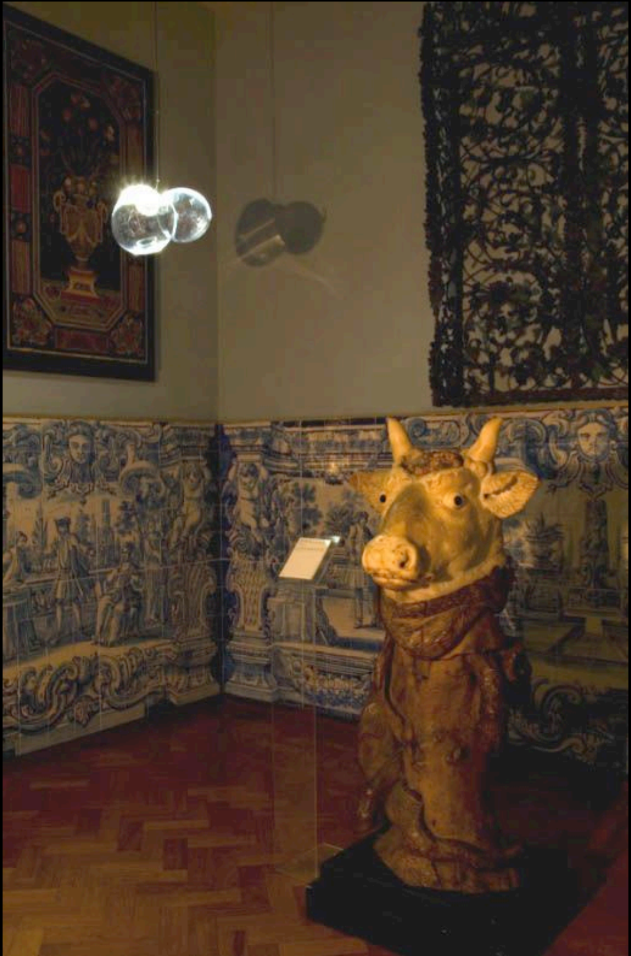
LUCID DREAM, 2006, ERIC KLARENBEEK

Inspired by soap bubbles, Lucid Dream plays on the ability of glass to transmit light by internal reflection.